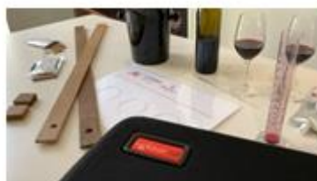
Nektar ID demo video